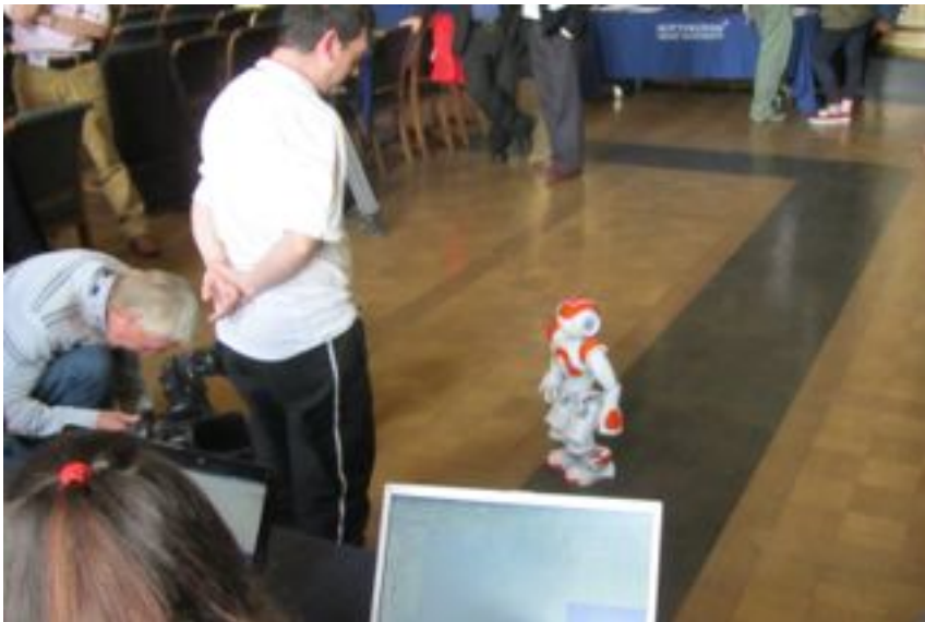
I'm listening to you: BBC TV featured programmable robots at ITAG in the evening news

Further information about ITAG can be found at http://www.ntu.ac.uk/apps/events/9/home.aspx/event/139932/default/itag_conference_2013 .